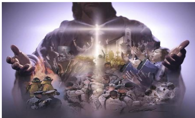
Thanking Jesus for the members of His body

Through thankfulness and prayer, we can be a great source of encouragement unto one another. In his letter to the church of Rome Paul states that we are to rejoice for "in